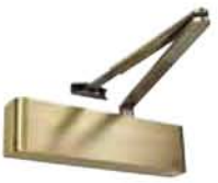
Antique Brass (AB)