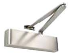
Satin Stainless (SS)