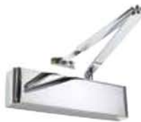
Polished Nickel Plate (PNP)