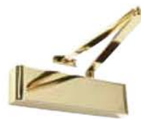
Electro Brass (PVD)