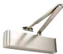
Satin Nickel Plate (SNP)