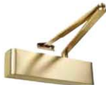
Satin Brass (SB)